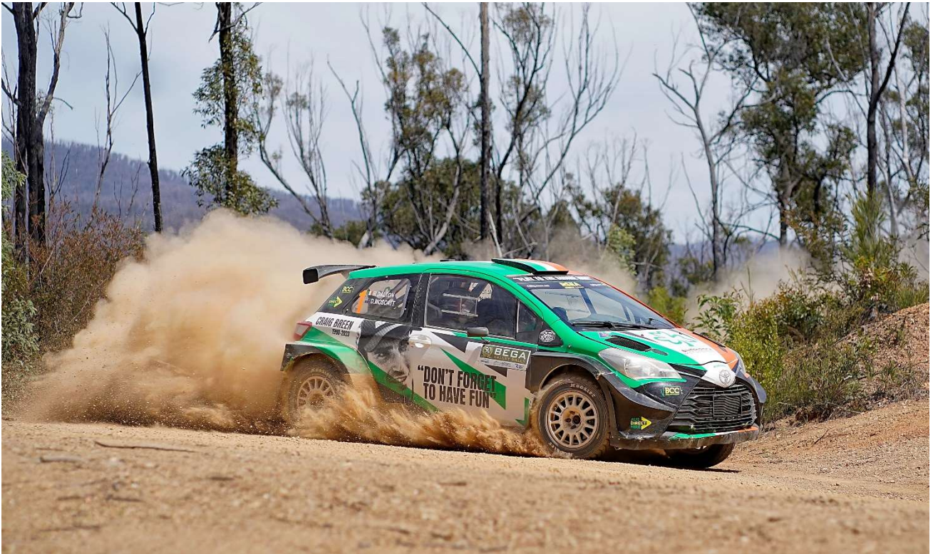
2023 Bega Valley Rally Winners Richie Dalton and Dale Moscatt

Round 2 of the NSW Rally Championship Round 4 of the East Coast Classic Rally-2WD Series Round 4 of the East Coast Classic Rally-4WD Series Round 2 of the NSW Clubman Rally Series Round 2 of the NSW Hyundai/Kia Rally Series Round 3 of the ACT Regional Rally Series